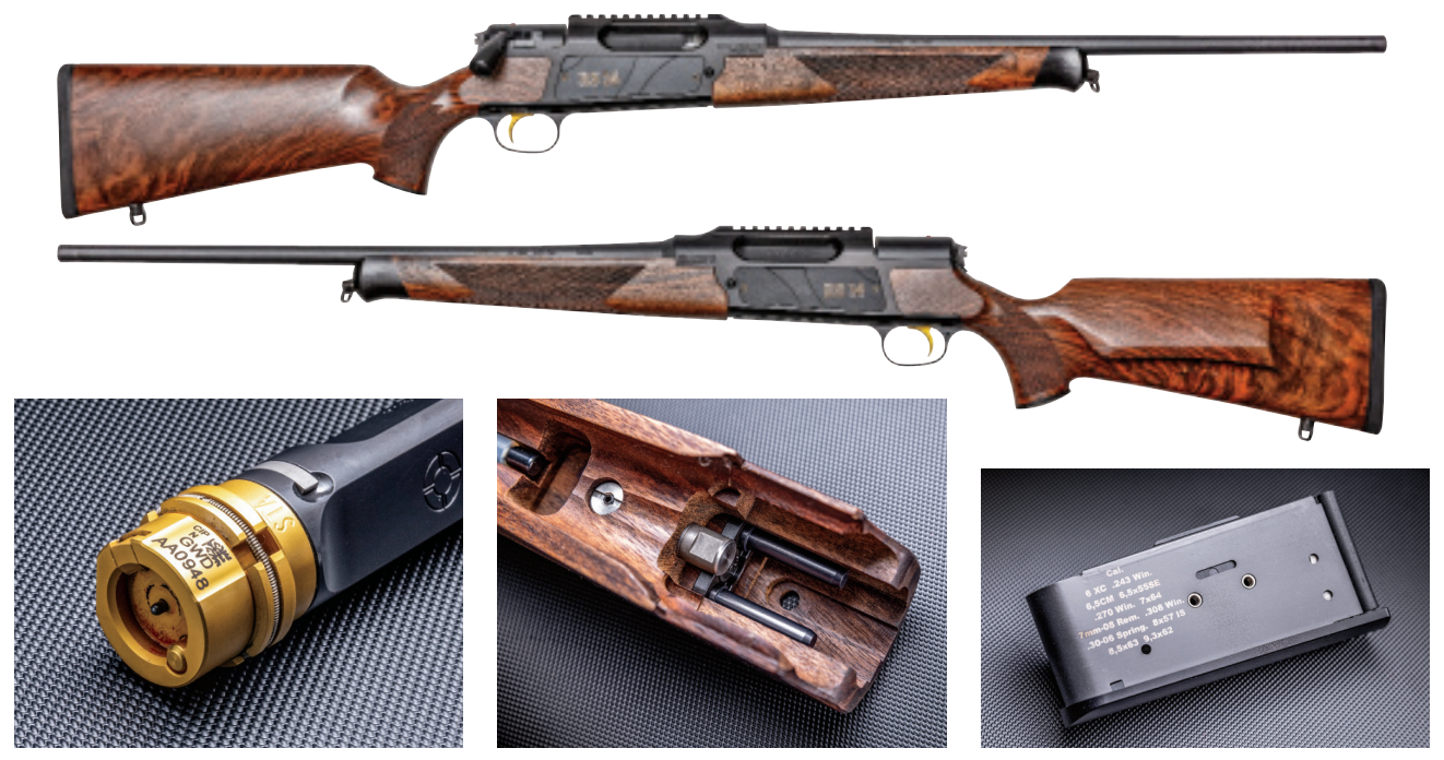
The one of the four radial bolt lugs handle is enough to keep the action safely closed when firing CIP-proof ammunition. The bolt head is complete with a titanium-nitride (TiN) finish.