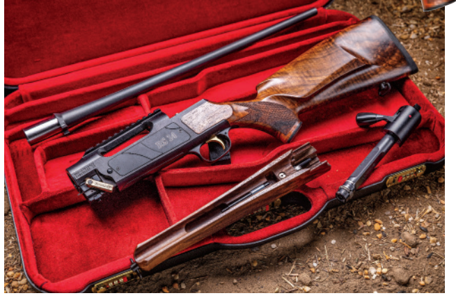
Some Strasser rifles can be purchased with with lined storage cases featuring a compartment to smartly organize each component. The cases are lockable, hardsided and worthy of travel.

Rifle Firsts The firearms design education Mathias, the 3rdgeneration Strasser, received in Ferlach bears some examina-