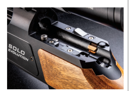
The small lug protruding up from the right-rear side of the receiver is a secondary safety lug to prevent the bolt from moving rearward unintentionally.

If you've got the coin, handling and shooting a Strasser is an experience unlike any other. I've handled a lot of rifles in my day, but I've never seen or worked with anything as precise or so finely made as this.